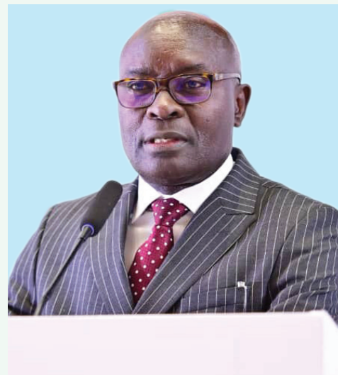
Justice Simon Byabakama Chairperson of the Electoral Commission (EC)

These functions are undertaken in fulfillment of the aspirations and declarations of the sovereignty of the people of Uganda as enshrined