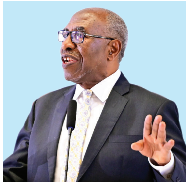
Rt. Hon. Ruhakana Rugunda