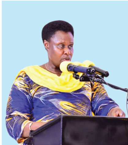
Jessica Alupo Vice President of the Republic of Uganda

human resource (lack of education and poor health for the population);