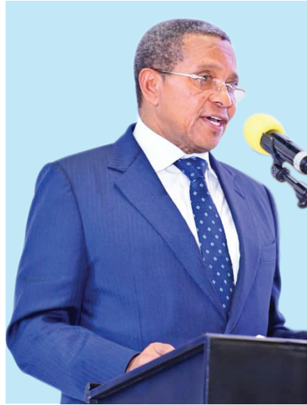
HE. Jakaya Mrisho Kikwete Former President, United Republic of Tanzania

As I mentioned earlier, I am the Chancellor of the University of Dar es Salaam. It will be amiss of me if I don't say a few words about the role of a University, particularly a State University such as Makerere, in a country's development